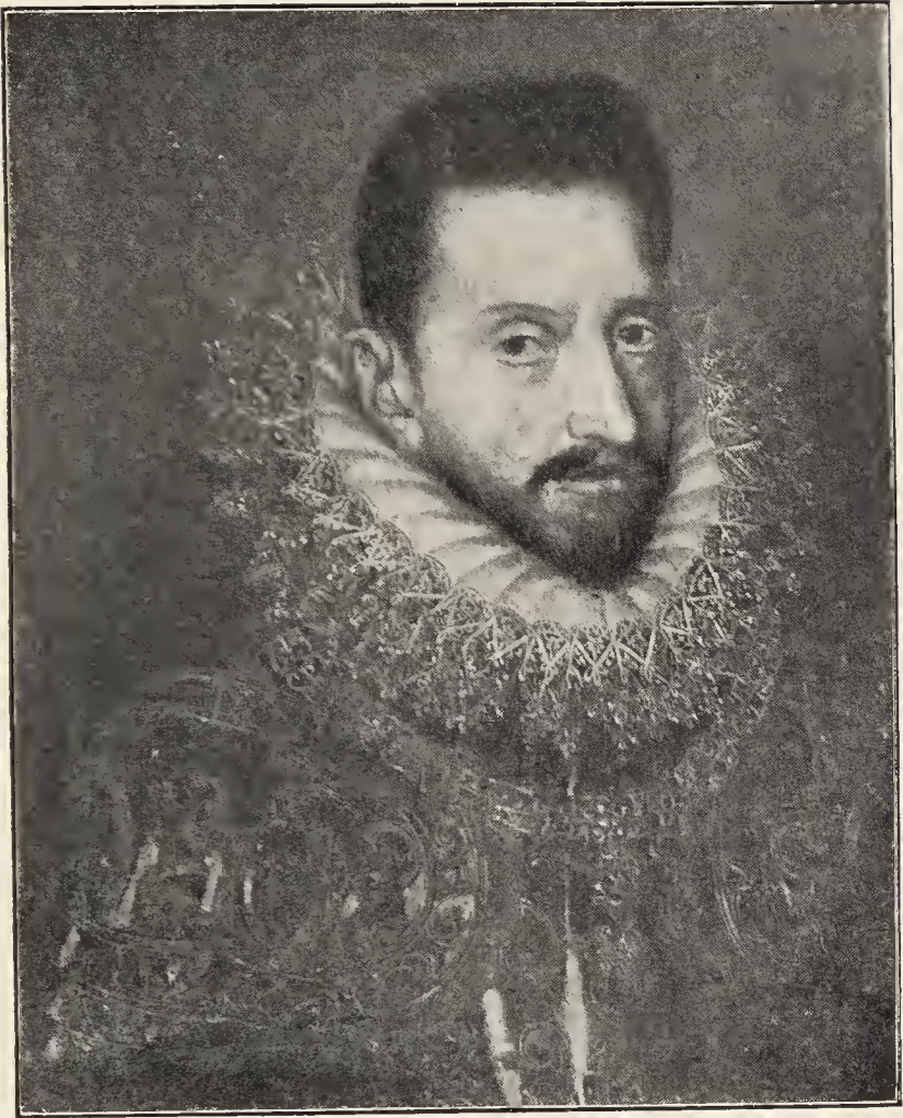
ALEXANDER FARNESE. DUKE OF PARMA Gallery of Versailles, France.